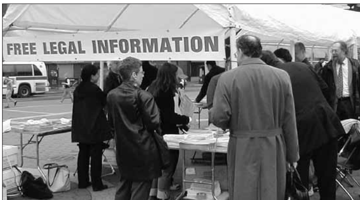
Law Day 2004